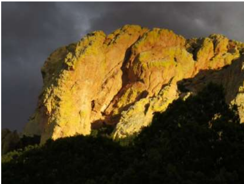
Late afternoon lighting